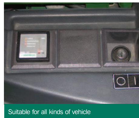
Suitable for all kinds of vehicle