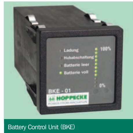
Battery Control Unit (BKE)

The shunt resistance may be installed at the negative terminal, the positive terminal or at any position in between.